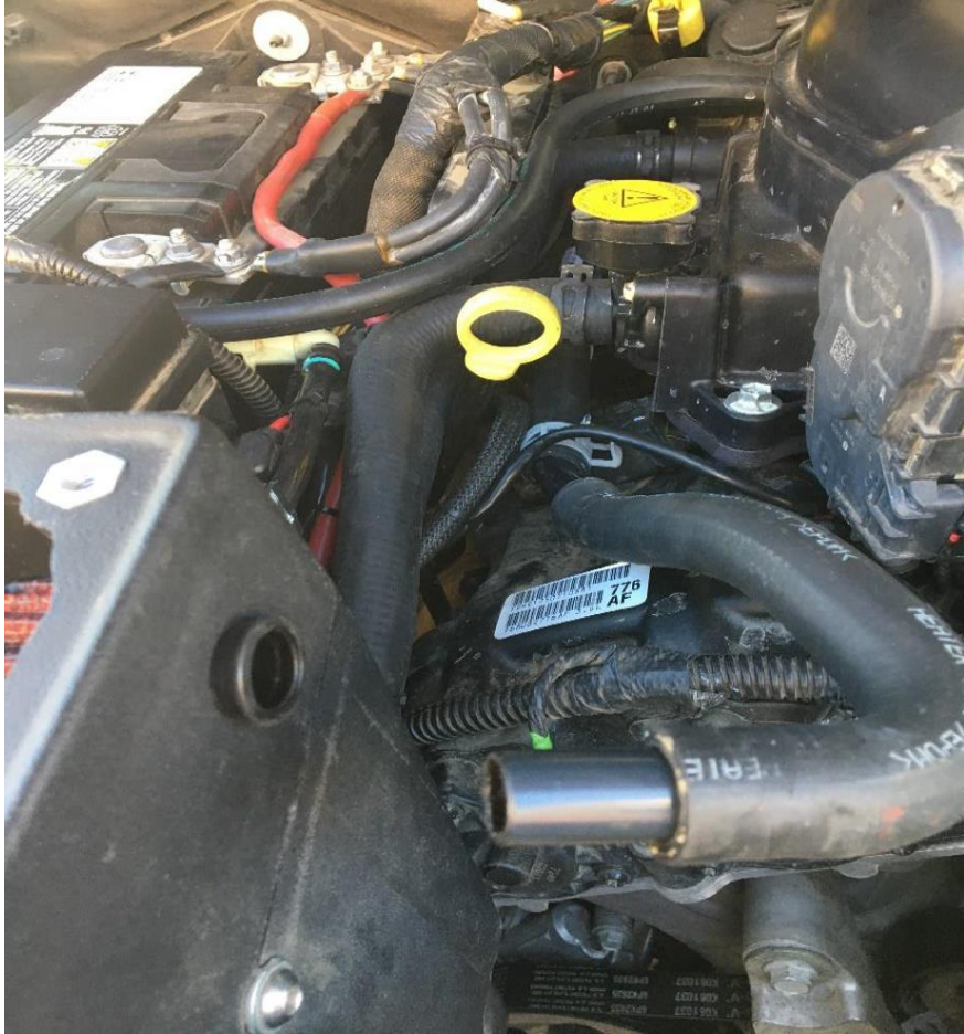
Insert non-barbed end of 68083250AB-C HOSE into Crankcase Breather Filter.