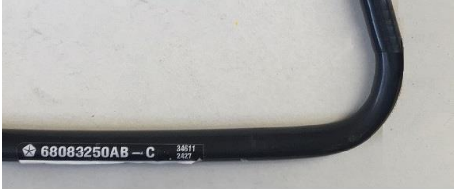
Part 1 Mod-A: Airaid 5/8" Breather Hose 7 1/2" long