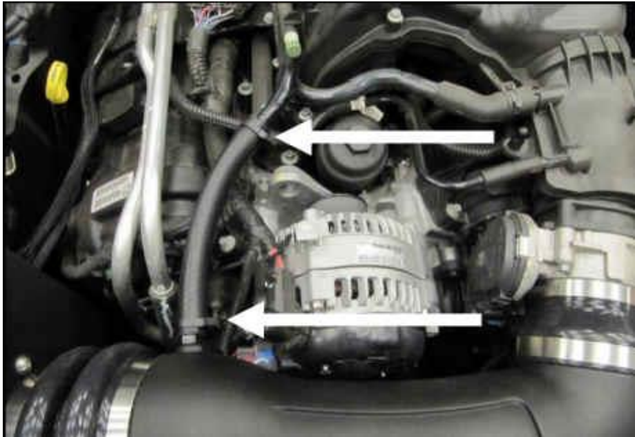
Part 1 Mod-B: 1/2" x 2 ft. PE 160 PSI Plastic Pipe (Lowe's Hardware Store)